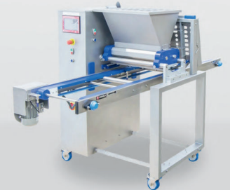
TF Cookie Making Unit