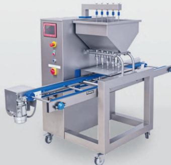
IA-IAS Injecting Unit