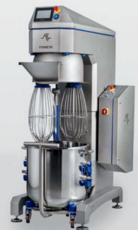
BFI Planetary Mixer