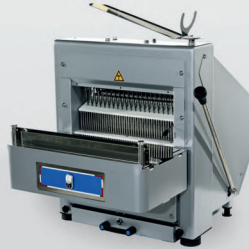
D/200 Cross Slicer