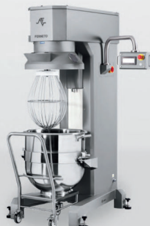
BTI Planetary Mixer