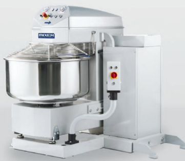
ASM EVO RB