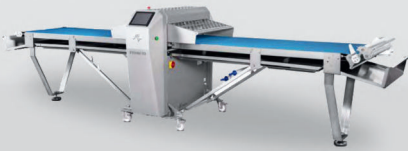
LMI Dough Sheeter

Artisan-scale equipment engineered for bakeries that demand uncompromising quality. Designed for consistent results, gentle dough handling, and reliable daily performance. Built to support growth without sacrificing craftsmanship. Engineered with flexibility in mind, allowing seamless adaptation to different products and production needs. Constructed using high-quality components to ensure long-term durability and minimal maintenance. Developed in accordance with modern hygienic standards for safe and efficient operation.