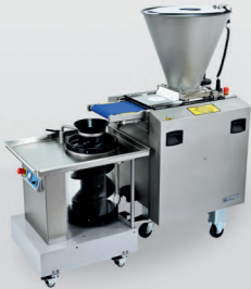
SLIM Globe Divider Rounder