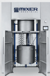
MR Planetary Blender