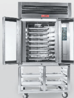
Mini Rack Ovens