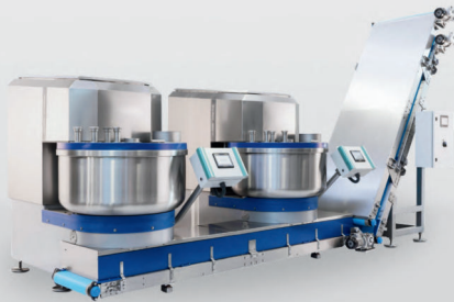
Bottom Discharge Systems