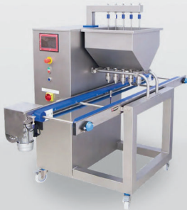
DA-DAS Dosing Unit