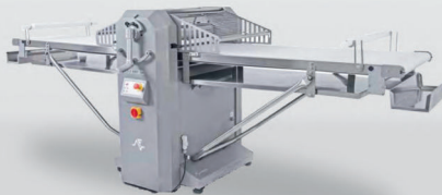
LMR Dough Sheeter