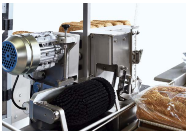
Brush roll for flattening the bag before closing.