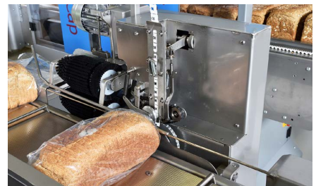
Bag closure with clip, clipband or tape.