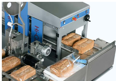
After slicing of the bread, a bag blowing device automatically opens the plastic bag.